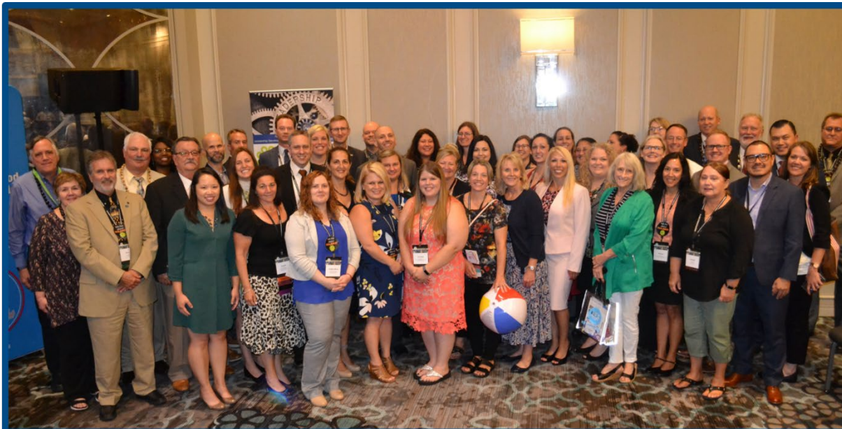
IFPTI Fellowship Alumni AFDO Conference Atlanta, Georgia